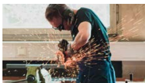
DIY Skills and Construction