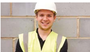
OHS and Industrial Skills