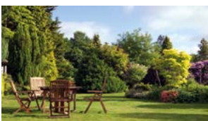
House and Garden